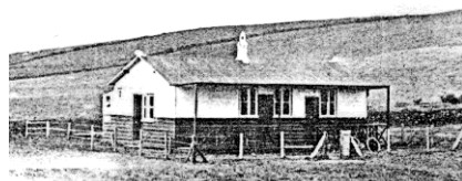
The Clubhouse on the Old St. Bees Golf Course : 1907

The single strands of barbed wire running on either side of the field boundaries are called "breast wires" and are used in modern farming to ensure that animals cannot get into adjacent fields and to protect the field boundaries from damage. In earlier times, the farmers just left the gorse to grow.