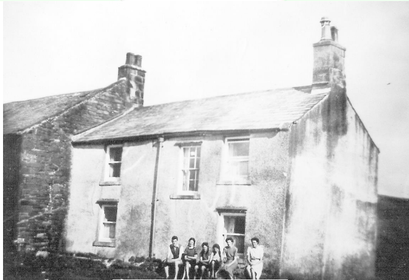
The Old Sea Mill

From Sea Mill to Coulderton and the Coast Path