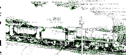
Coal Train on the line south of St. Bees

At this point, those wishing to have a slightly shorter, easier walk can turn right (north) and walk back along the Nethertown Road, past Lovers Lonnin to the Seamill car park.